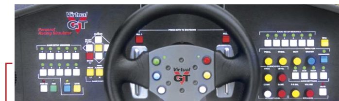
Software Controls Recall your favorite ten car and track combinations.

Obsessively engineered for realism and ease of use... Press one button to recall your favorite car and track combinations, touch another button and apply your preferred audio and vibration feedback levels. Formula 1 style paddle shifters provide split second gear changes for maximum control.